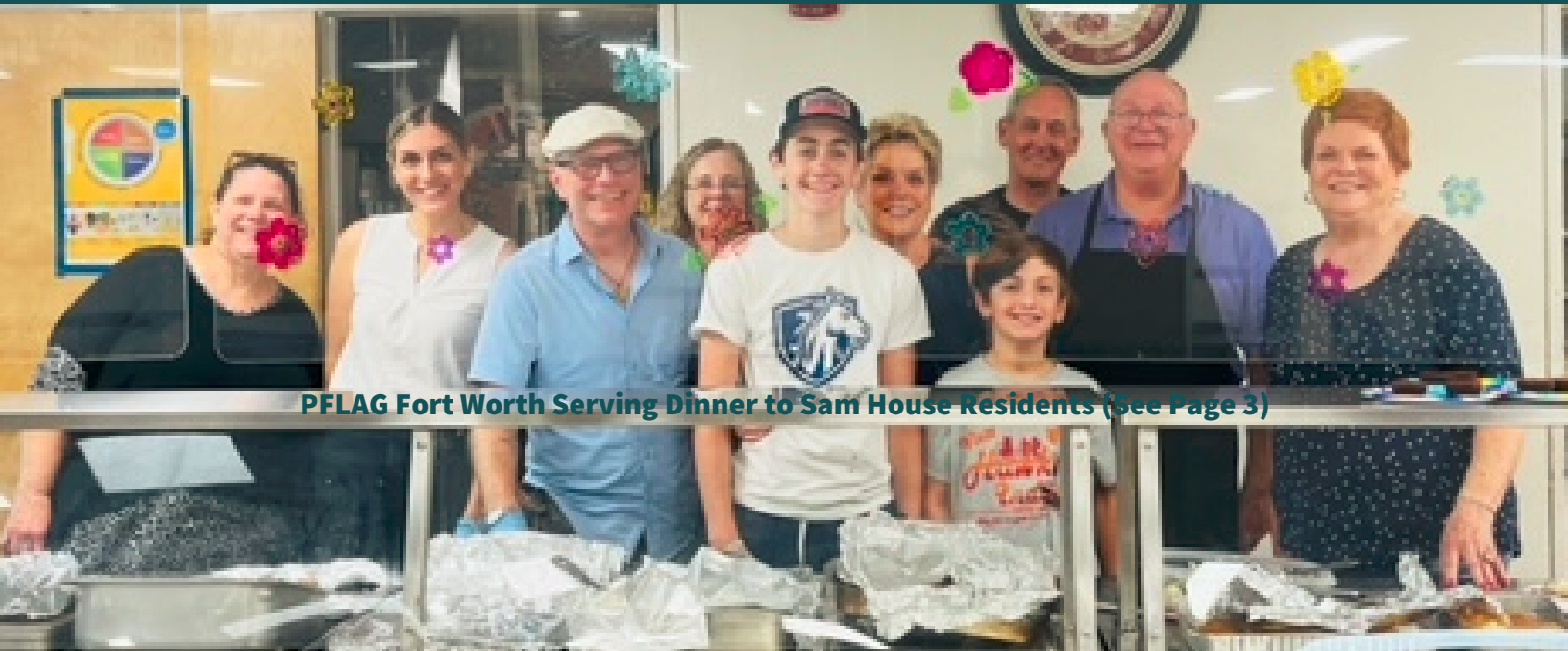
PFLAG Fort Worth Serving Dinner to Sam House Residents (See Page 3)